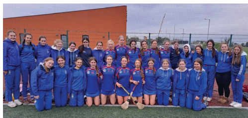
Camogie Panel who represented Munster in the All Ireland 7s Final in Co Meath October 2023.