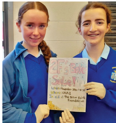
Second Year CSPE class, 2F, had a bake sale on Monday, 20 November in aid of the Dillon Quirke Foundation and the TY's who will visit Ursuline Schools in Kenya next year