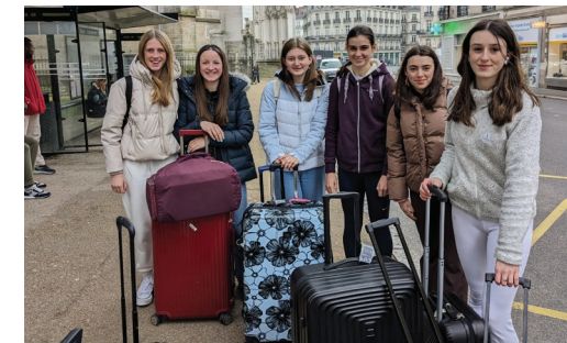
TY students on French Exchange Programme to Blanche de Castille, Nantes