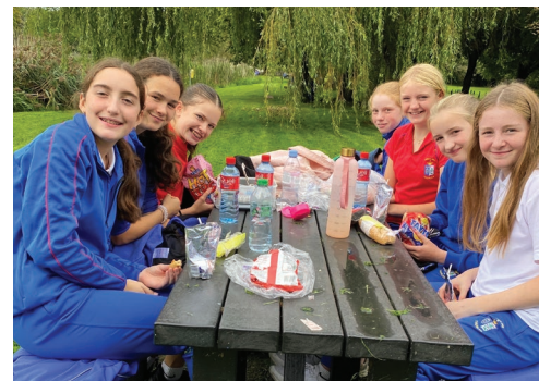
First Years had a great day out picnicking in Templemore Park in September.