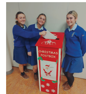
Student Council Christmas Postbox