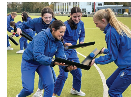
TYs from Room 7 doing the marble run at the fundamentals workshop