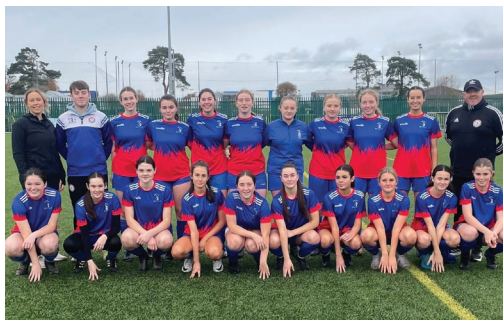
U19 Soccer Team