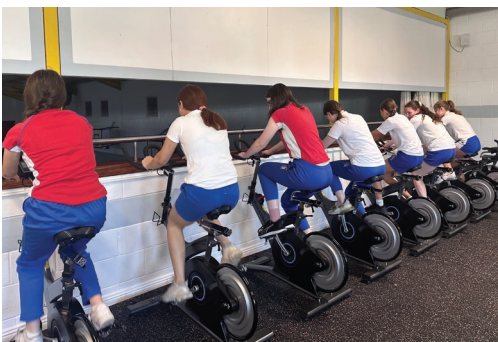
Students enjoying a class in our new gym