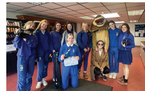
TYs in character for the Film Workshop in November