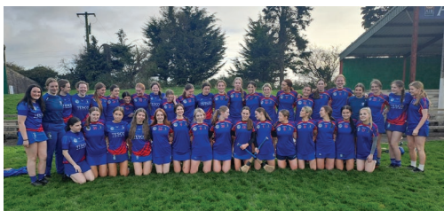
Senior A Camogie Team after their win against Cashel on 21 November.

21 November, 2023, Ursuline Thurles V Cashel Community School Won 0-22 to 2-5