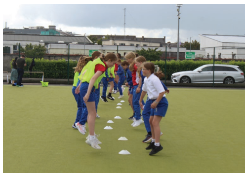
First Years enjoyed ice-breaker games on the Astroturf on their first day in the Ursuline.