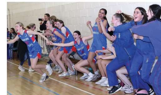
Celebrations of the Cadette basketball team at the final whistle