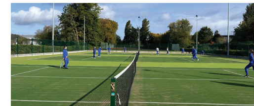
TY students at tennis coaching every Monday