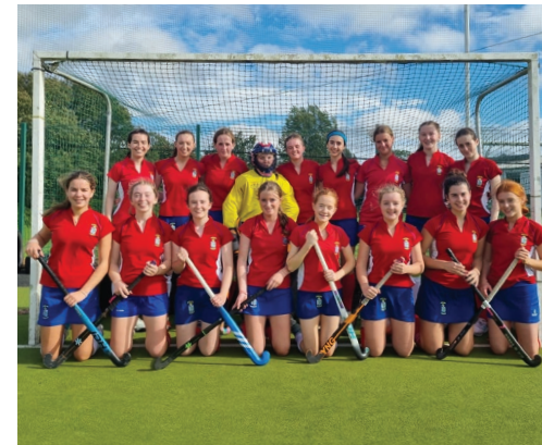
Senior A Hockey Team 2023/24.

Ursuline Thurles First Year Blue v Laurel Hill Secondary Won