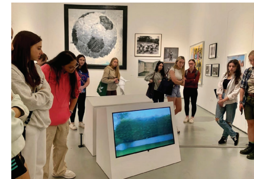
Sixth Year Art students perusing the temporary art exhibition on sport on display at the Butler Gallery in Kilkenny on 6 September.