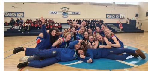
Cadette Basketball Team - South East League Champions

The Ursuline had two teams of First Year basketball players invited to participate in challenge games in the Presentation Thurles both before and after mid-term break. On Monday, 13 November they played teams from Loreto Clonmel as well as Pres Thurles. The invitation was much appreciated on both occasions as our players got a chance to compete against others and hone their skills on the courts.