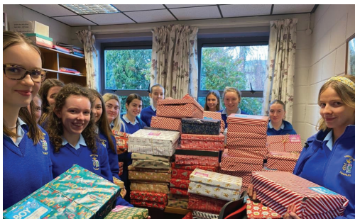
Charities Committee collected and sorted through 157 boxes for Team Hope after mid-term break. Many thanks to students and their families who donated so generously to this cause.

The Ursuline Charities Committee have been busy working on a couple of different fund raising initiatives since the school year began. They operated a shop each night of the school musical. The Little Mermaid , selling bottled water and chocolate during the intervals. This was a great success, raising €850 over the six performances, vital funds for the Ursuline schools in Kenya. They also enthusiastically supported the Sixth Year led Mission Day which was collecting on behalf of the same cause. Since mid-term break they have been busy encouraging the student body to bring in Christmas shoe boxes for the annual Team Hope appeal, an organisation the Charities Committee have a long standing association with. This year the Sixth Year school councillors worked in collaboration with the Committee to fill shoe boxes with their First Year classes. All the 157 presents donated by the Ursuline will be delivered to children affected by poverty in many parts of the world, providing essential hygiene and educational items and a lot of joy to those most in need.