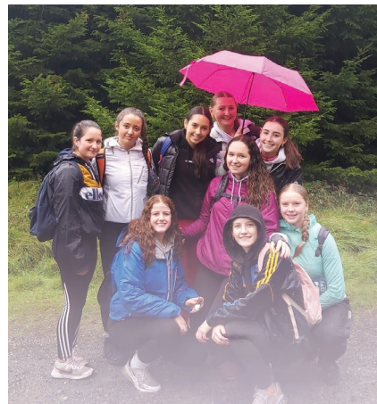
TYs and Fifth Years on the Gaisce Hike in September.