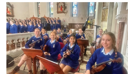
Members of the Ursuline Senior Orchestra at the Opening of the Year Mass celebrated in the Cathedral of the Assumption, Thurles on Thursday, 21 September

Senior Orchestra started their performance year by playing the overture of The Little Mermaid every night of the show. They are busily preparing for the Christmas season with the upcoming Carol Service and Mass of the Gifts. They are rehearsing much loved Christmas classics like Walking in the Air and Oh Holy Night which are staples of the Carol Service each year. Junior Orchestra played I Giorni for the November Prayer Service, a breathtakingly beautiful piece by Italian composer Ludovico Einaudi. Meeting in the Band Room of the Music Academy every Monday the Junior musicians are also learning Alla Hornpipe from Handel's Water Music and the Carol of the Bells .