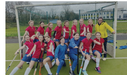
First Year Hockey players surfing the breeze.