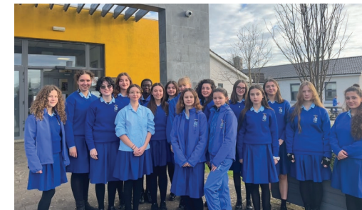
Some of our International & Ukrainian students this year.

This September, the Ursuline also welcomed a number of new Ukrainian students to our school, to join those who arrived last year. Since their arrival, the girls have spent their time working on their English, adapting to life in Thurles and becoming part of our school community. For those in TY, a particular highlight was taking part in our musical, The Little Mermaid .