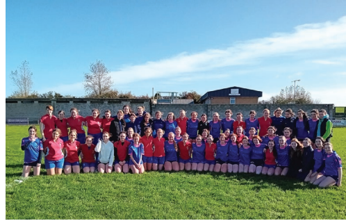
The Ursuline Rugby team who played Borrisoleigh in the school's first ever competitive rugby game