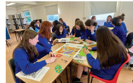
TYs searching for 'The Lost Dutchman's Goldmine' in the Develop Me Workshop.