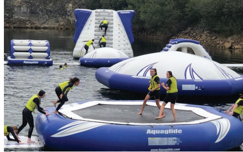
TY day of bonding and team building at Ballyhass Lakes