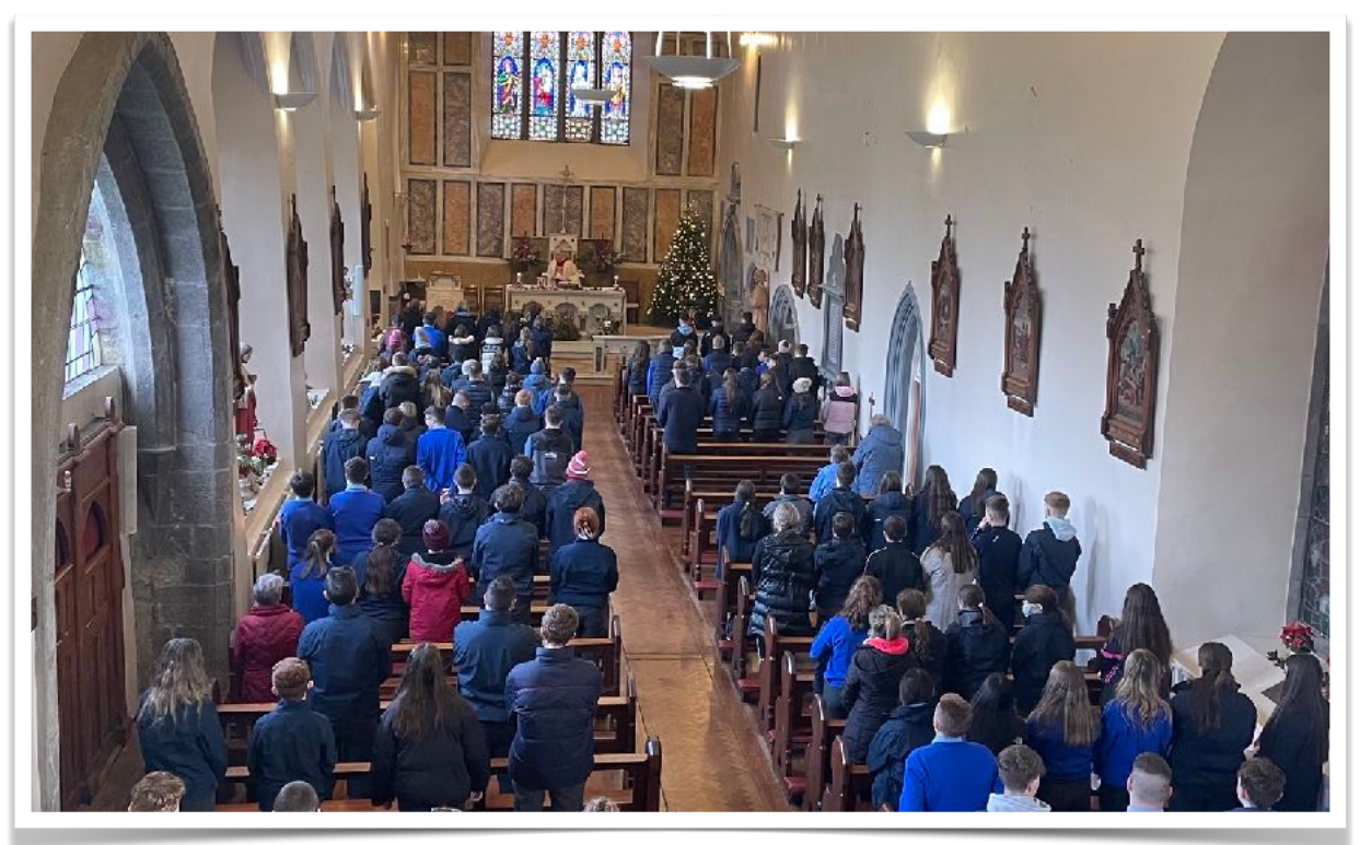
Friday, January 6th 2023

Pupils and staff from Patrician Presentation Secondary School Fethard, participated in a celebration of The Feast of the Epiphany in the local Augustinian Abbey, Fethard. This was the first time since Covid that we were able to gather together, with members of the local community to celebrate mass. It was a welcome return to normality!