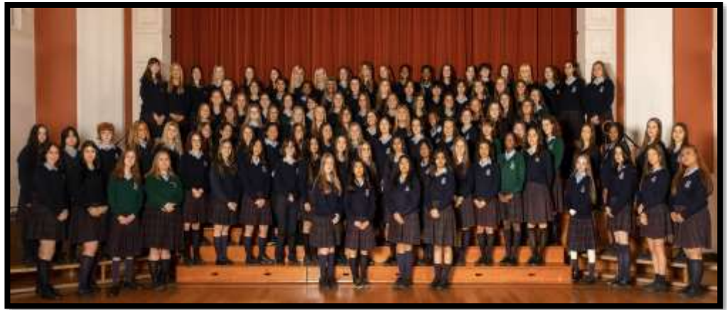
CLASS of 2022

"What do you want to be when you grow up?"