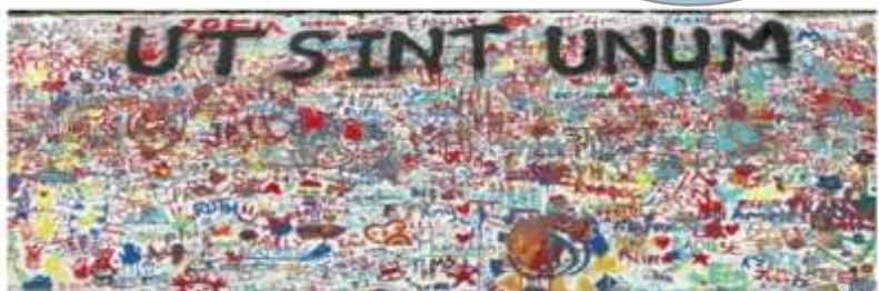
Graffiti wall led by TY Journalism Class