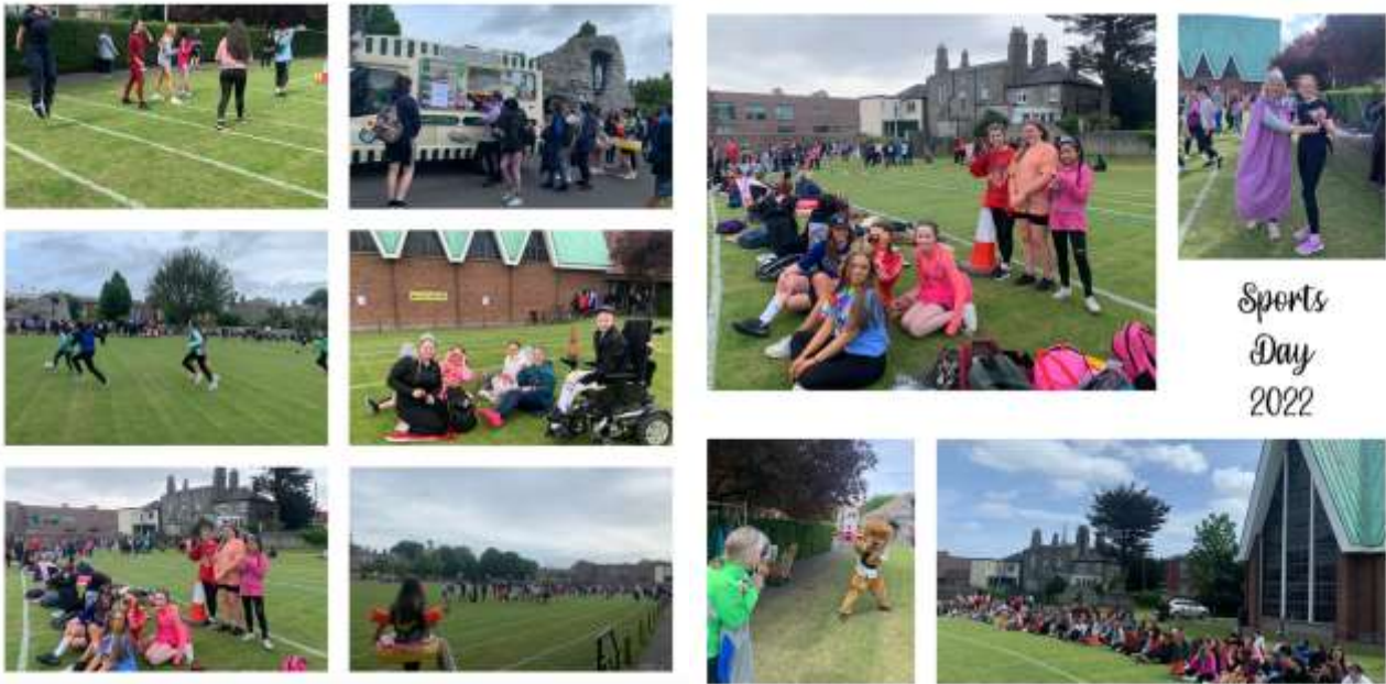
Sports Day 2022