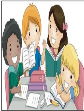
Táimid ag obair le chéile ar scoil!

4th Classes have also been working on report writing