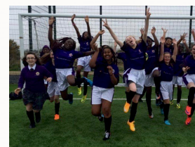
Involvement in Sport

Le Chéile Schools create environments that are caring and compassionate, where each child is known and appreciated as an individual.