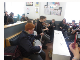
Music in our schools