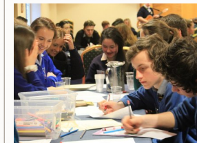
Annual student conference