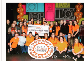
Wellbeing and community involvement