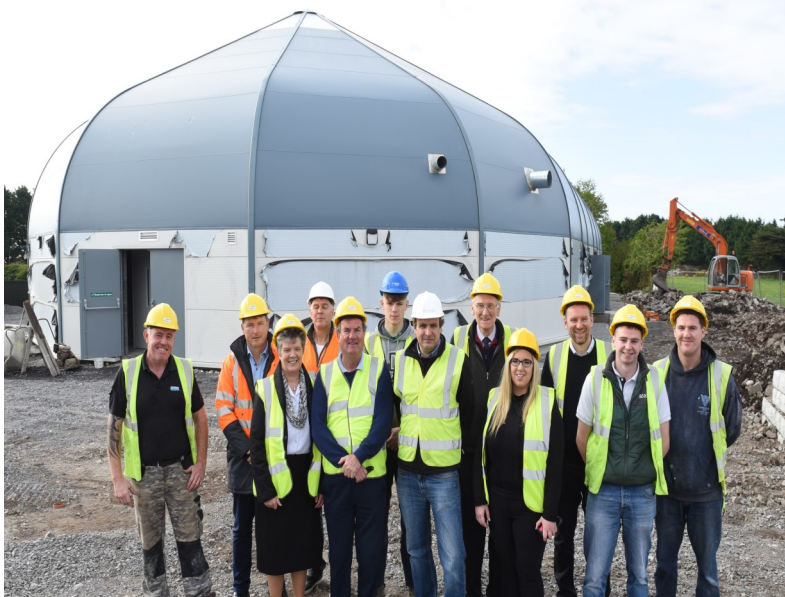
Plenty of Happy Faces as the Sports Hall at Jesus & Mary Secondary School Salerno progresses.....