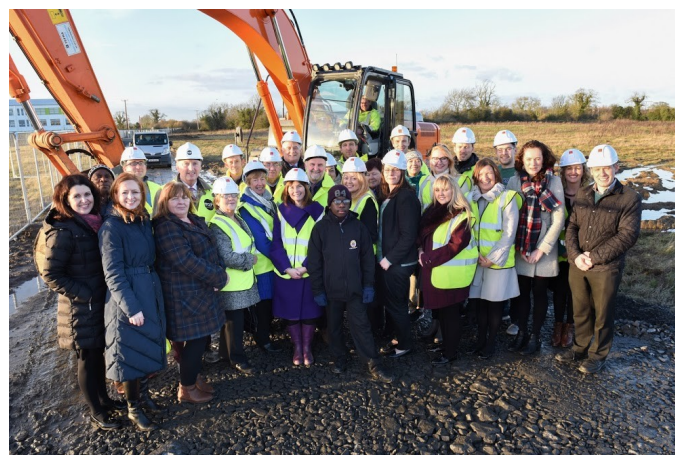
Teachers, student, parents, Board of Management and Trust representatives