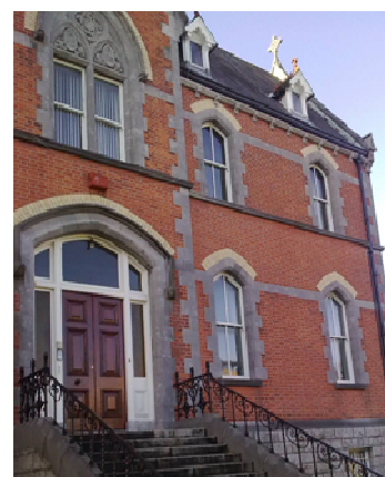
Middle windows only!

Le Cheile Office St Mary's, Bloomfield Avenue, Donnybrook Dublin 4